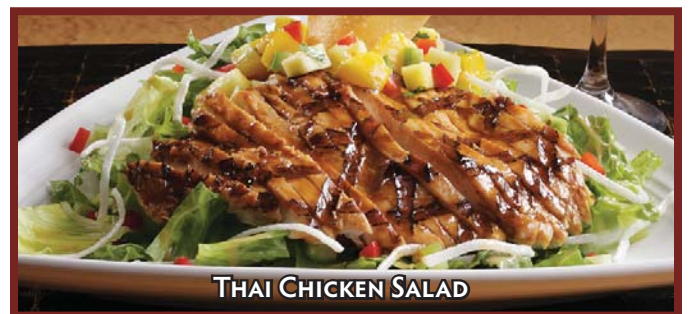
THAI CHICKEN SALAD

POTTS CHICKEN CAESAR Choice of Grilled or Blackened chicken, romaine, rosemary garlic croutons, caesar dressing, shredded parmesan 10.99 With Grilled or Blackened SALMON 14.99