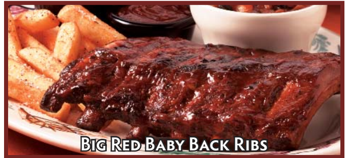
BIG RED BABY BACK RIBS

King of steaks! Seasoned, simply grilled. With house vegetables, cheesy mashed potatoes 19.99