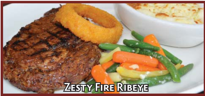
ZESTY FIRE RIBEYE

Served with a Skinny Salad , choice of dressing