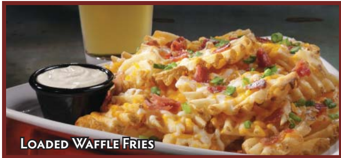
LOADED WAFFLE FRIES

LOADED WAFFLE FRIES Cheddar-jack cheese, chopped hickory smoked bacon, sliced green onion. Garlic sour cream 8.49 Available with POTTS CHIPS