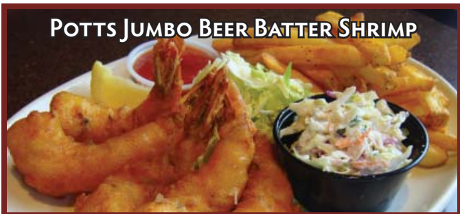
POTTS JUMBO BEER BATTER SHRIMP

Enjoy with Any Entree: CUP OF SOUP | GREEN SALAD | CAESAR SALAD $2.79 each