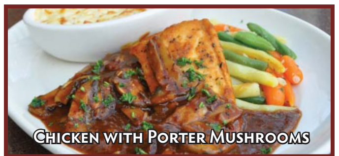
CHICKEN WITH PORTER MUSHROOMS

Pan-seared, topped with mushrooms sautéed in Total Disorder Porter garlic demi-glace. Cheesy mashed potatoes & house vegetables 13.99