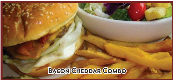
BACON CHEDDAR COMBO

Served with SKINNY HOUSE SALAD-Choice of Dressing, SKINNY HOUSE FRIES.