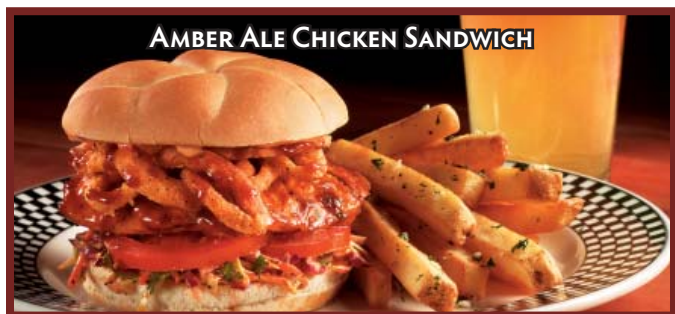
AMBER ALE CHICKEN SANDWICH

Substitute: WAFFLE FRIES | ONION RINGS | SWEET POTATO FRIES | FIRESIDE BEANS | GARLIC FRIES 99¢ ea.