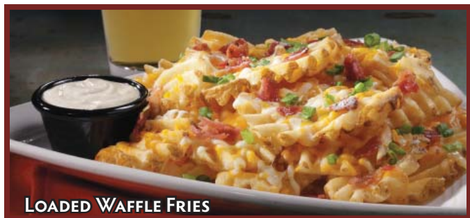
LOADED WAFFLE FRIES